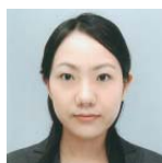
IIZUKA, MIRI Ministry of Land, Infrastructure, Transport and Tourism Research Project: International Governance and Competition in the Northern Sea Route